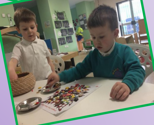
Year 3 Year 3 have been working hard in maths and PSHE.