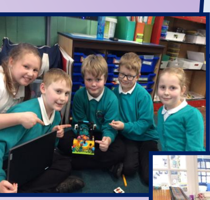
Year 4 Year 4 had lots of fun being Lego engineers and creating superhero art!