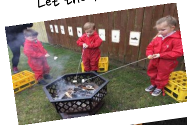
Let the fun begin!